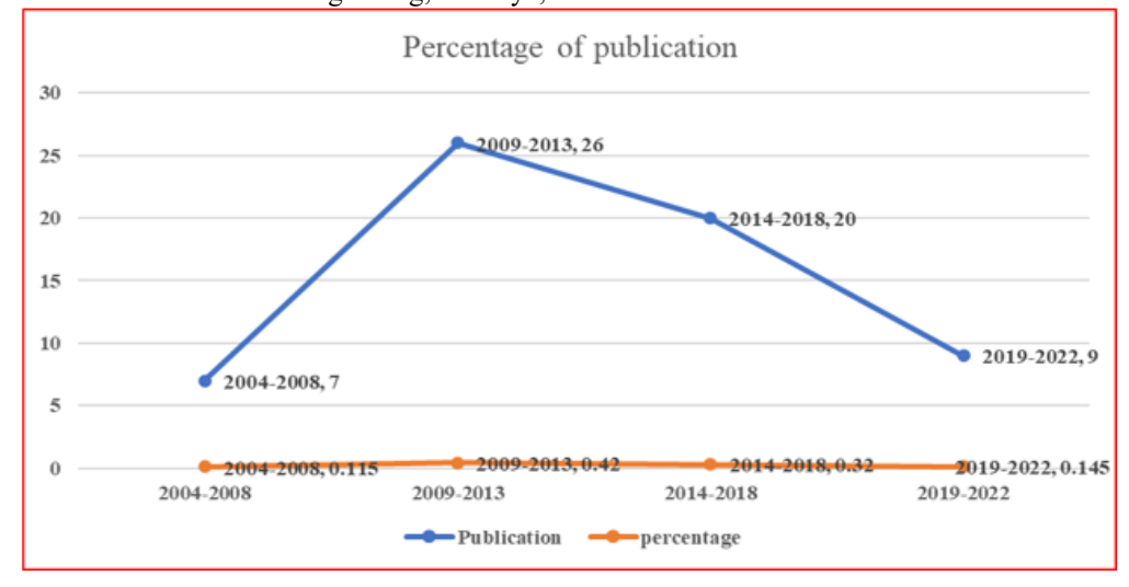
Fig 3.2 Percentage of Publication

Nigeria, Bangladesh, India, Malaysia, and China, which have made a lot of contributions. Since 2004, there have been more publications, which suggests that researchers are becoming more interested in this area. According to [13], the US and the UK have the most publications, respectively. However, most of the top contributing organizations come from the United States.